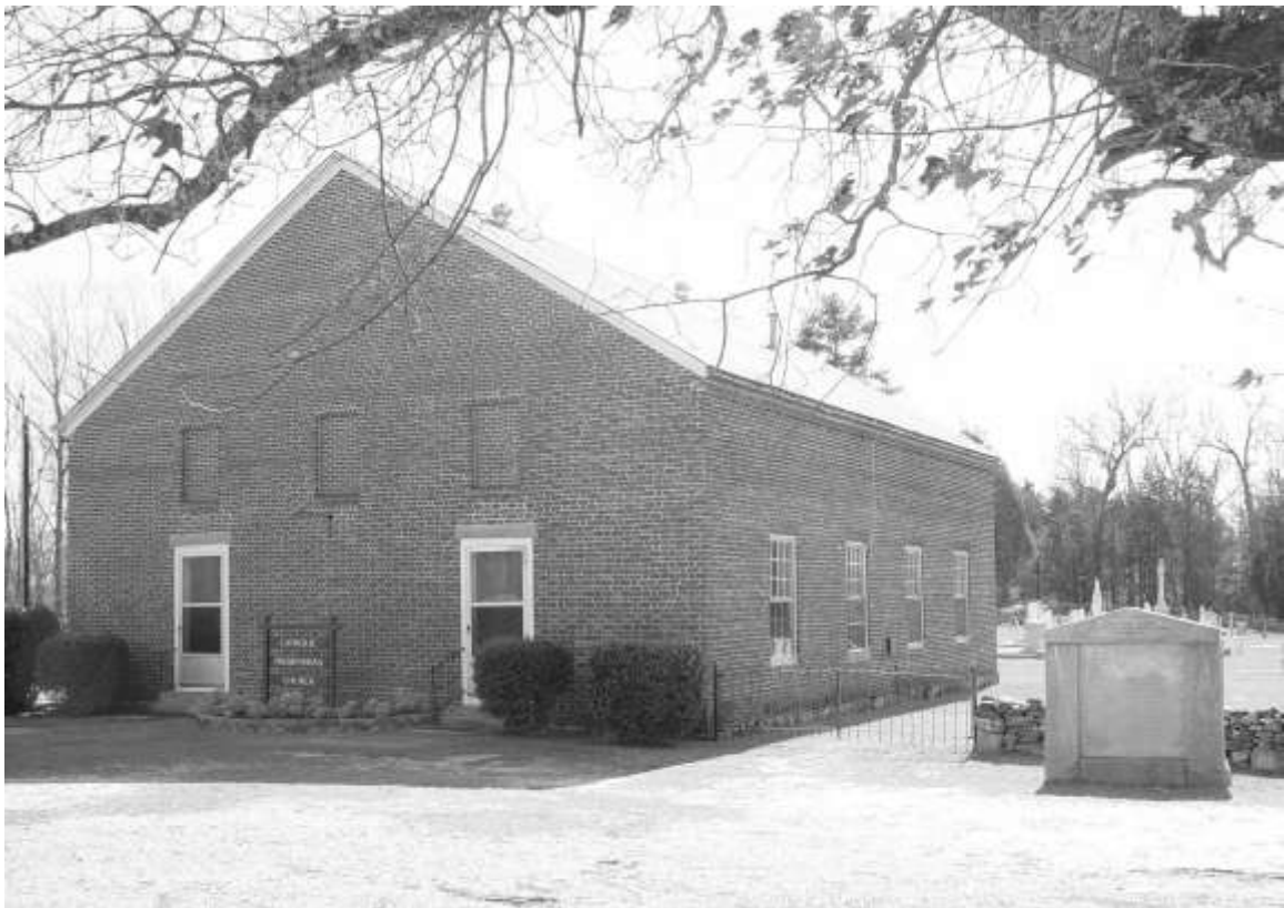
CATHOLIC PRESBYTERIAN CHURCH